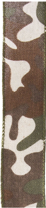
Canvas Camouflage 1.5x10yd HQ51370908 $6.99/roll