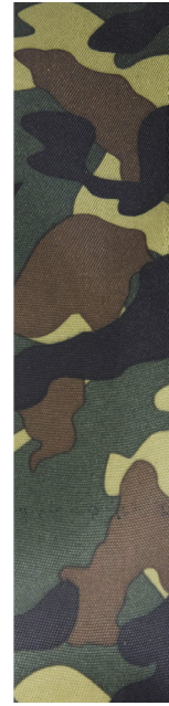
Undercover 09 Green 25yd H162254GRN $16.79/roll