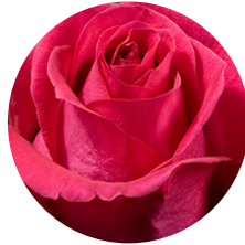
High & Mora