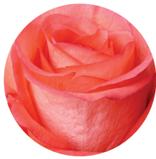
High & Blooming