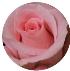
High & Divine