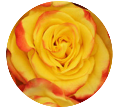
High & Yellow