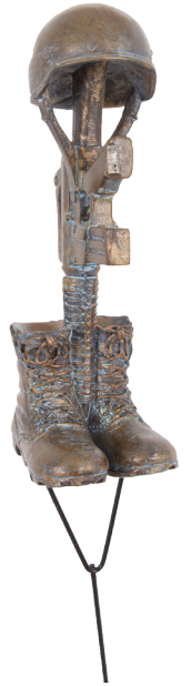
Battle Cross Pick H11744C $7.99 each