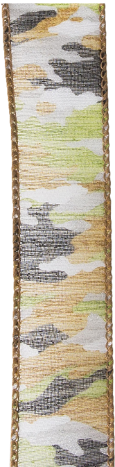
Treed Green 1.5" 10yd HS00106090100586 $4.49/roll