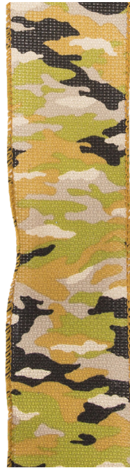
Camouflage 40 10yd H347401 $6.45/roll