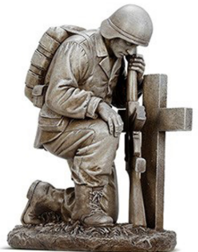
Soldier and Cross Statue H11369 $24.99 each