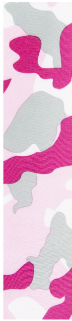
Undercover 09 Pink 25yd H162254PNK $16.79/roll